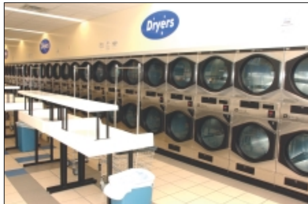
Two modulating fans provide make-up air for all dryers through two four-square-foot openings in roof.

The CPC-3 controller is microprocessor-based and compatible with virtually all VFD controlled modulating fans. The controller is simple to program and operate and offers many options including interfaces with a motorized louver or CO detector. It also has a built in alarm relay that