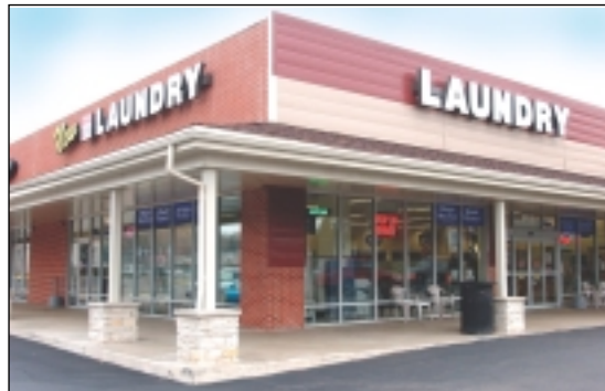
Fox Lake Laundromat, located in Fox Lake, Illinois, features 54 large commercial dryers that require up to 20,000 CFM of make up air.

A laundromat contractor and an equipment distributor teamed up to design a unique mechanical system for a new facility. The system provides up to 20,000 CFM of make-up air for 54 large commercial dryers from two four-square-foot roof openings. The brains of the system is a Tjernlund CPC-3 Constant Pressure Controller. It senses room pressure and automatically adjusts two roof-mounted modulating fans to deliver the amount of air needed by the dryers when they are operating. Multiple benefits for the owner include reduced construction costs, fewer roof penetrations, increased interior comfort for customers and energy savings. The system has been operating successfully since May 2005.