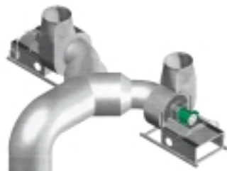
Redundant VSUB Series Universal Blowers

The exhaust vent is symmetrically split at the roof or outside wall into two inducers/blowers. Each leg of the split has a Tjernlund supplied motorized damper. The damper of the inactive inducer/blower remains closed to prevent bypass of air. If the active system fails, its damper will close and the back-up system damper will open allowing the redundant inducer/blower to operate. The alarm output relay can be tied into a building management