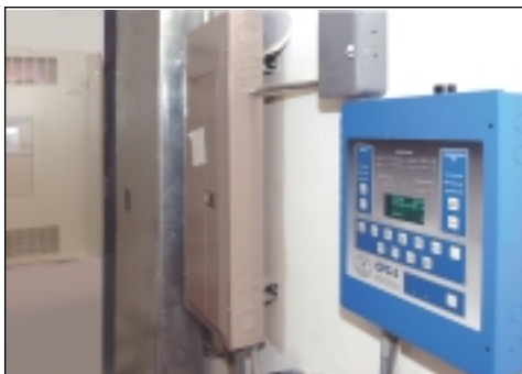
Above: Tjernlund's CPC-3 Constant Pressure Controller senses room pressure and adjusts modulating roof mounted blowers to deliver the volume of make up air required by dryers in operation.

Add value to your next commercial project by specifying Tjernlund exhaust and ventilation systems.