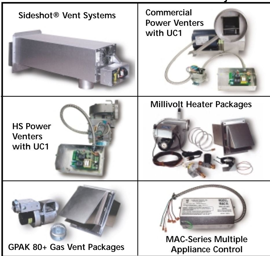
Some of Tjernlund's sidewall venting products and accessories are shown above.

By using the Tjernlund VP-Series package, contractors can side wall vent standard FVIR water heater models at total cost typically lower than purchasing the upscale models. What's more, when the heater needs to be replaced—especially pertinent in areas where water heater life is shortened by adverse water quality—the venting system can remain intact resulting in a savings for the owner.