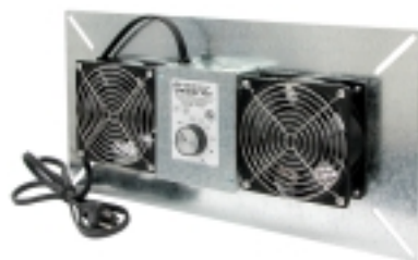
On large crawl spaces, John Barta installs Tjernlund's double fan model V2D UnderAire ventilator.

The crawl spaces Barta normally works in range from 2,000 to 6,000 square feet. They have screened openings in the wall. However, in winter, many owners cover the openings with wood or